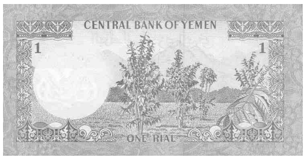
The back of 11a.