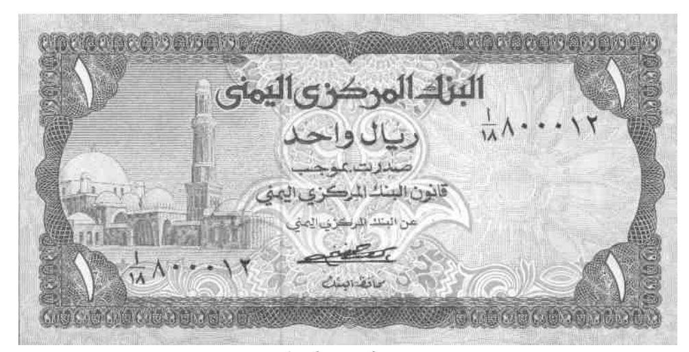
The front of 11a.